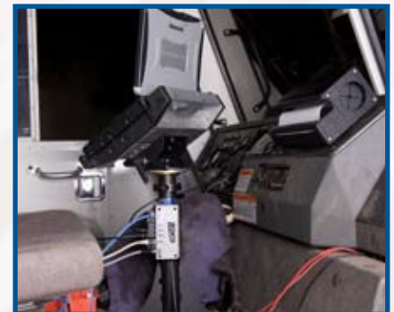
TuffHub mounted inside a municipal services vehicle