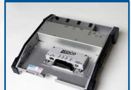
TuffHub mounted to the bottom of a CF19 Toughdock