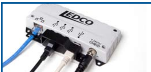
TuffHub with strain relieved connectors