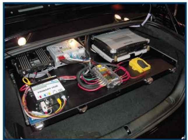
ChargeGuard Auto Shut-Off Timer on a Trunk Tray in a Chevy Caprice.