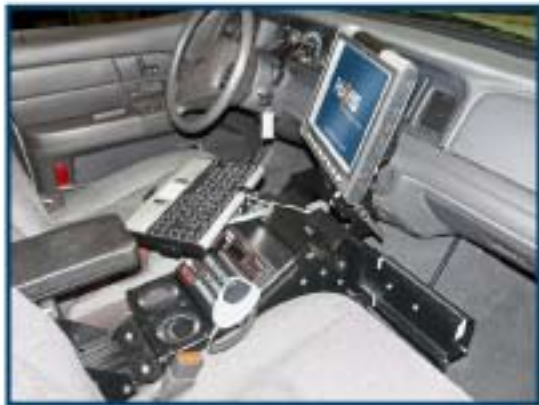
C-5M-830 shown with Motorola MW800 monitor & keyboard, and Pentax PocketJet printer