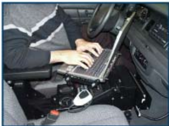
C-5M-830 shown with Dell Latitude Laptop, and Pentax PocketJet printer

The heavy duty swing arm is a perfect mount for laptop computers or keyboards. The height is set at installation so there is no need for up/down mechanisms that are rarely used. The swing-arm is safely locked into stored position or released for use by a spring lock.