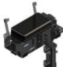
Side Mounted Pedestal Arm Rest with Printer Bracket (C-ARPB-106 shown)