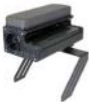
Top Mount Arm Rest with Printer Bracket (C-ARPB-101 shown)