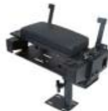
Pedestal Armrest with Printer Bracket (C-ARPB-108 shown)