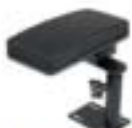
Armrest for Tunnel Mount with Hinged Pad C-ARM-104