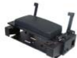
Flat Surface Mounted Armrest with Printer Bracket (C-ARPB-112 shown)