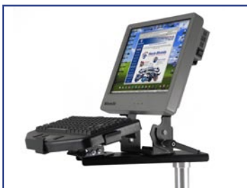
Perfect for mounting laptops or 2 & 3-piece modular computer workstations.