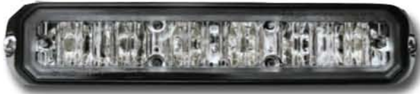
MS6BS Horizontal Optics