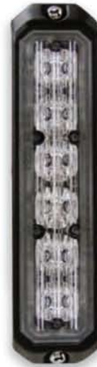
MS6BSV Vertical Optics